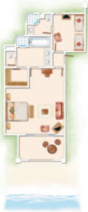
2-Bedroom Family Apartment