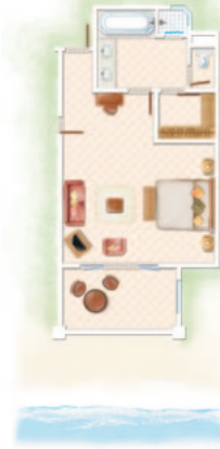
Deluxe Room / Deluxe Ground Floor