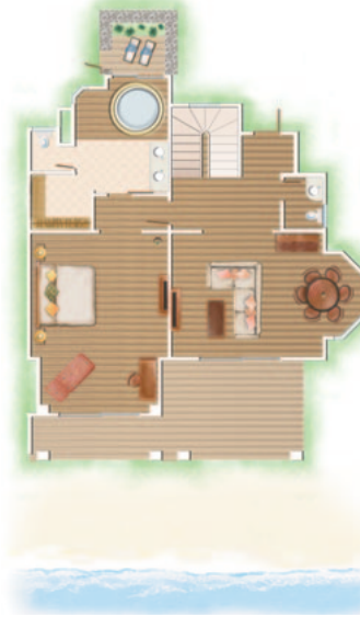
2-Bedroom Family Suite