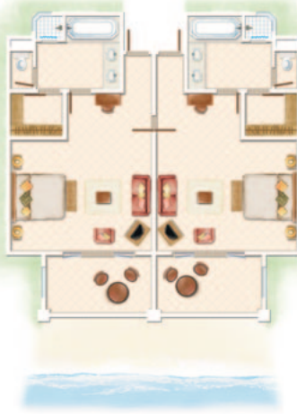
2-Bedroom Deluxe Family Apartment